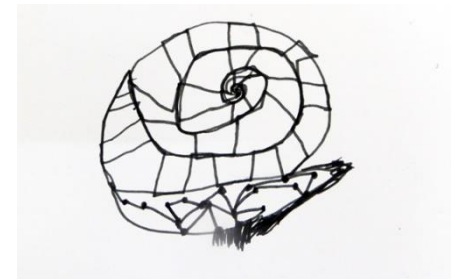
Continuous Line Drawing