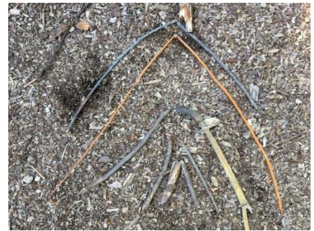
Patterns with nature