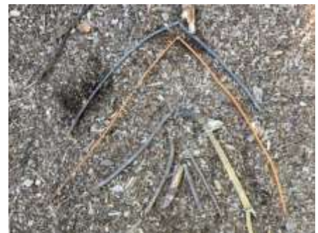
Patterns with nature