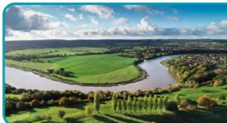
Longest river in the UK: The River Severn.