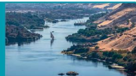
Longest river in the world: The River Nile, Africa