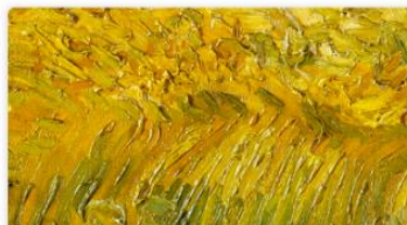
Impasto technique used by Van Gogh.