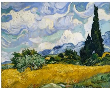
Van Gogh Wheat field with cypresses .