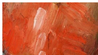
Mixing colours on canvas to create texture.