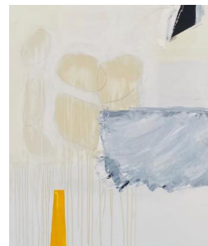
The lighthouse by Charlie French.