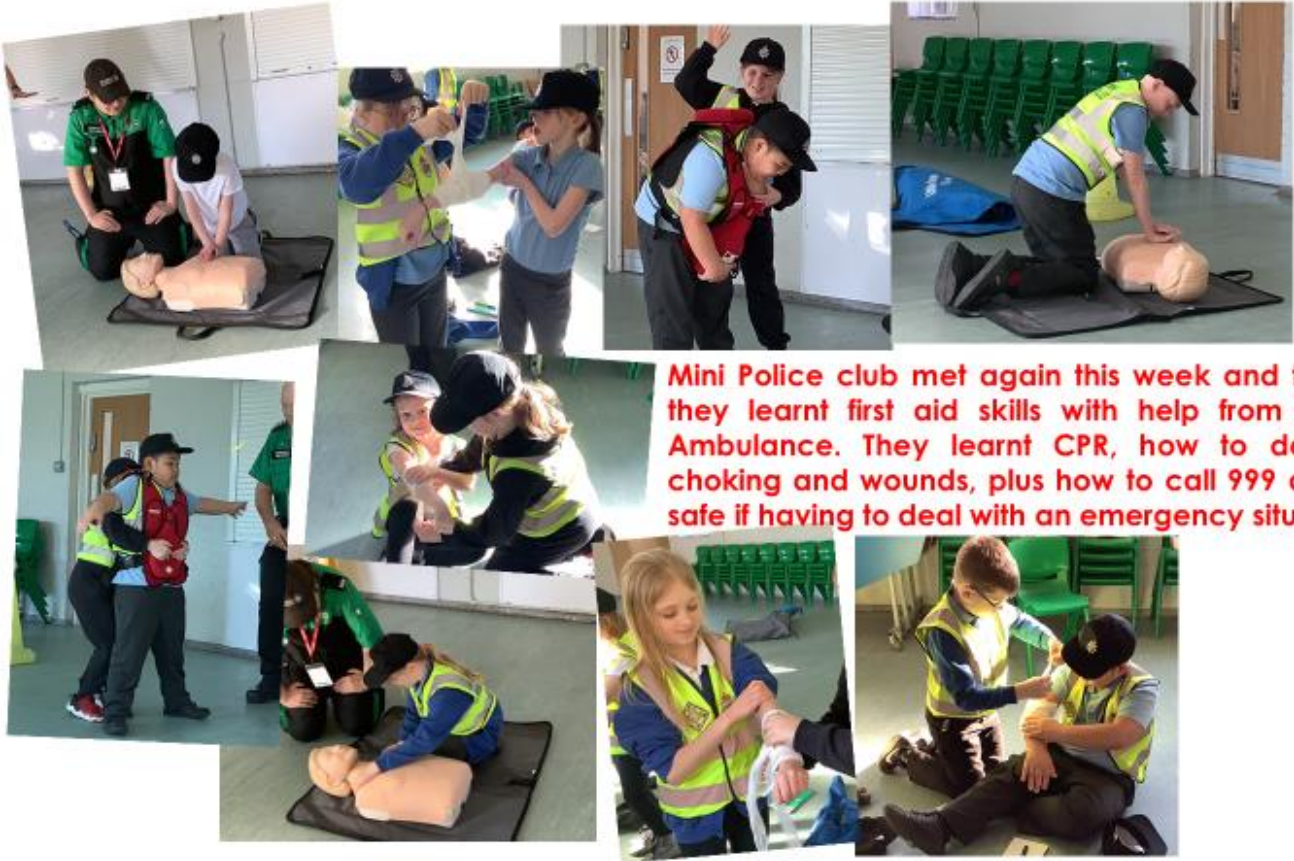
Mini Police club met again this week and this time they learnt first aid skills with help from St John Ambulance. They learnt CPR, how to deal with choking and wounds, plus how to call 999 and stay safe if having to deal with an emergency situation.