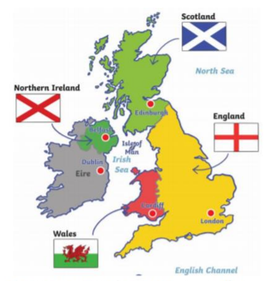
There are 3 main seas surrounding the UK.