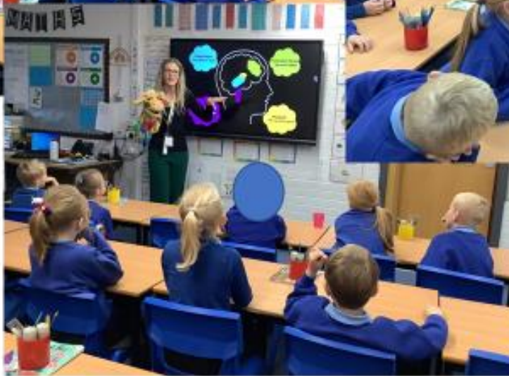
We have had Life Education workshops in every class this week. These photos are from King-Smith Class.