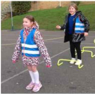
Year 2 multiskills event at Hardenhuish School