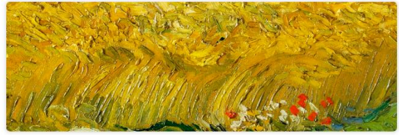
Impasto technique used by Van Gogh.