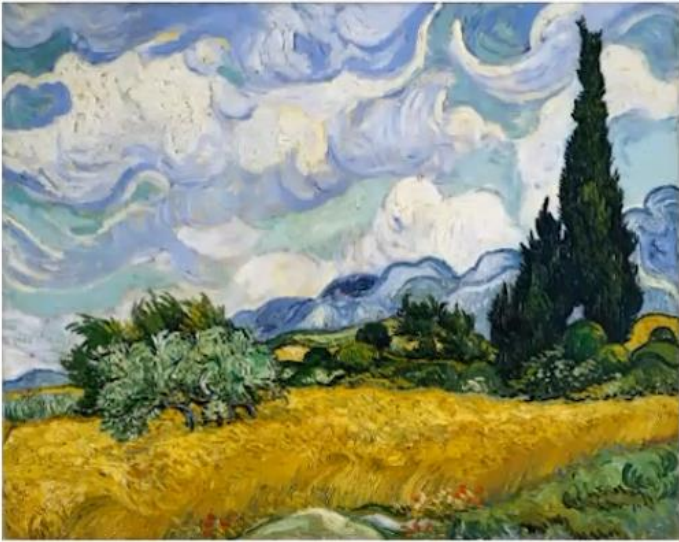
Van Gogh Wheat field with cypresses