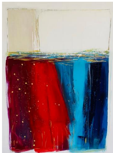
Weekend Vibes by Charlie French