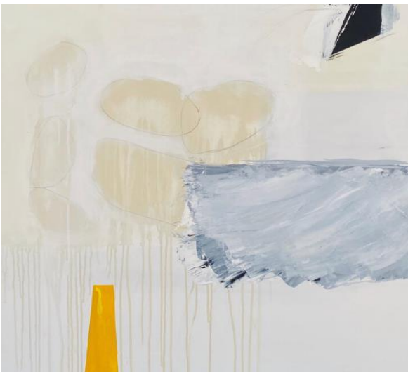
The lighthouse by Charlie French