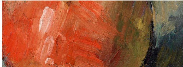
Mixing colours on canvas to create texture